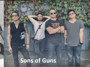
Sons of Guns