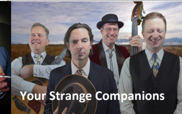
Your Strange Companions