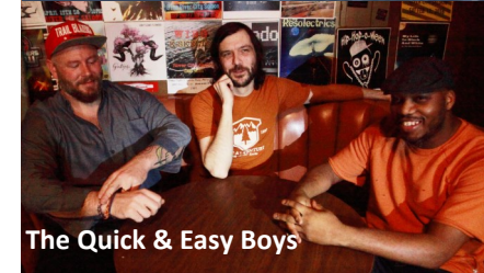
The Quick & Easy Boys