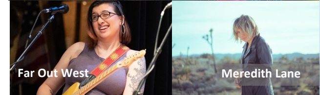
Far Out West