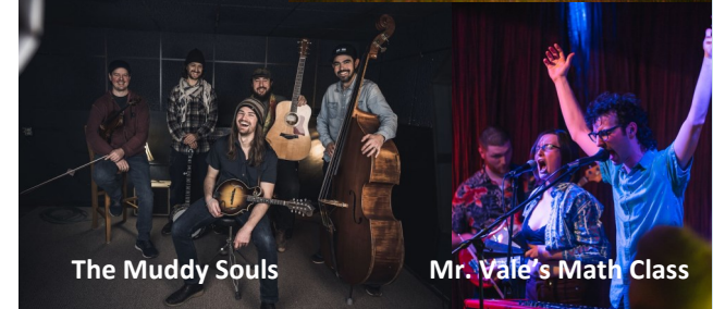
The Muddy Souls